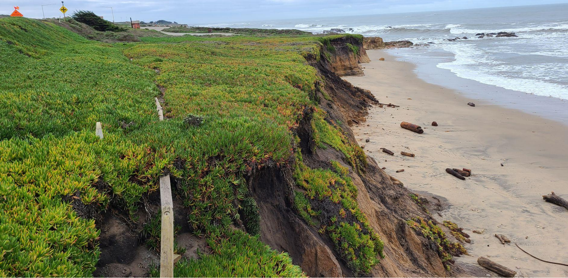
Pescadero Creek Beach Coastal Trail (photo taken January 19, 2023)