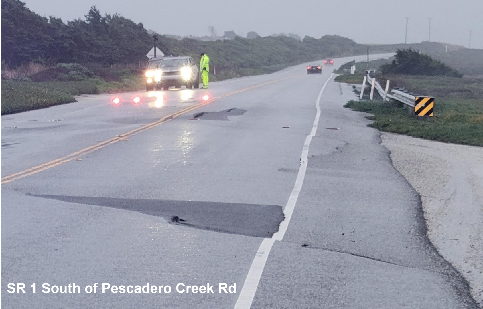
SR 1 South of Pescadero Creek Rd