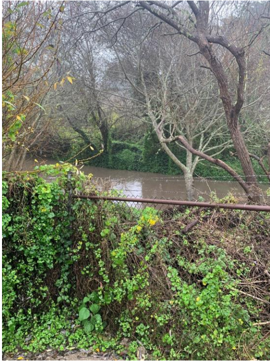
Pilarcitos Creek Flooding