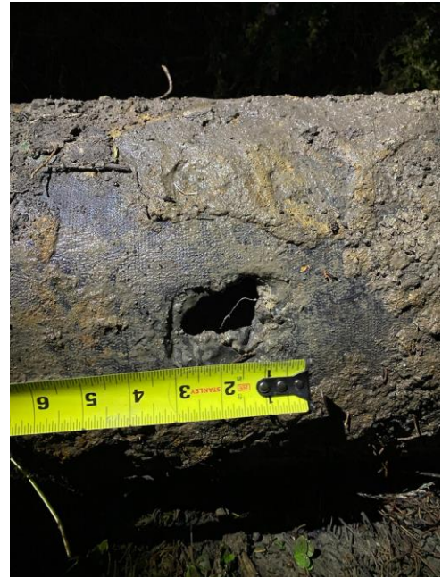
Break of IPS FM