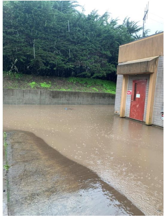
Flooding Outside Electrical Building