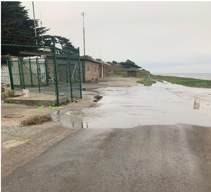
Overflow at Montara PS