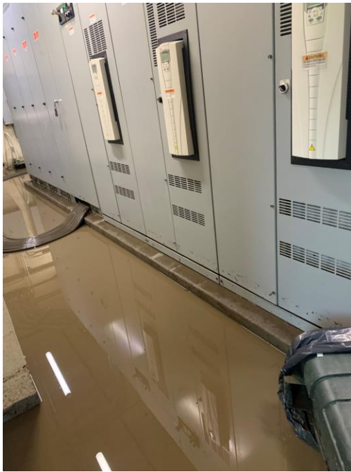
Flooding Near VFD's