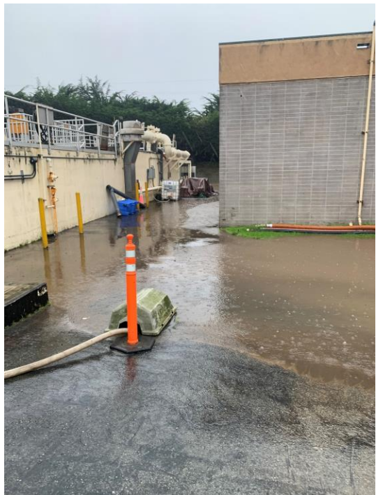
Flooding Around MB1