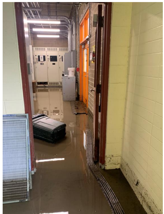
Flooding Inside Electrical Room