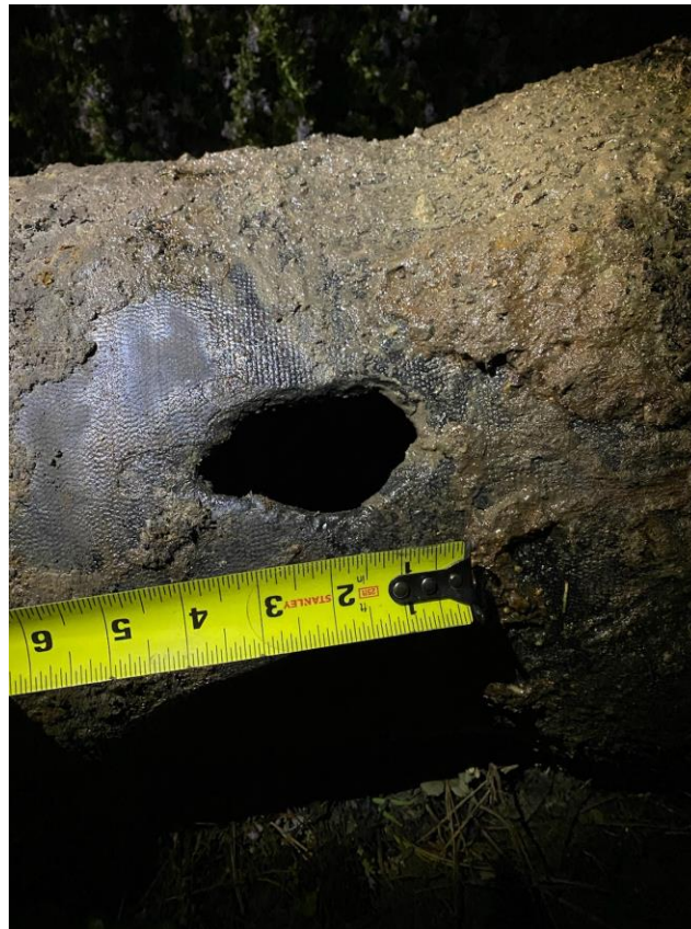
Yet Another Break FM