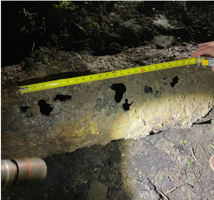
Break at IPS Montara FM