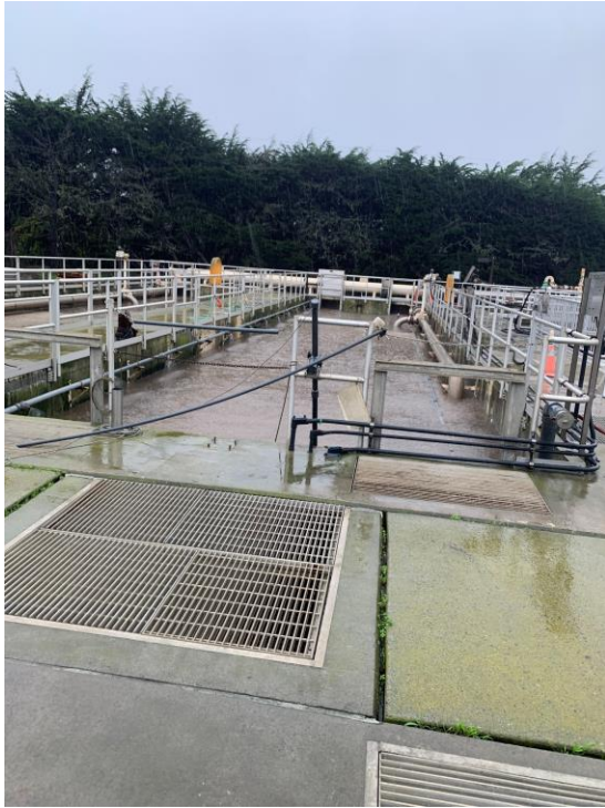
Aeration Basin Filling Up