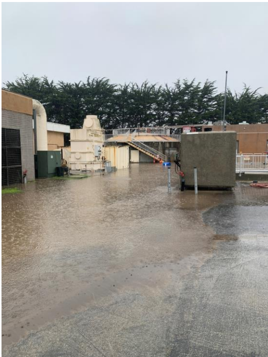
Flooding Near Diesel Storage