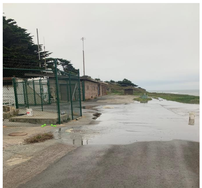
Overflow at Montara PS Picture 2