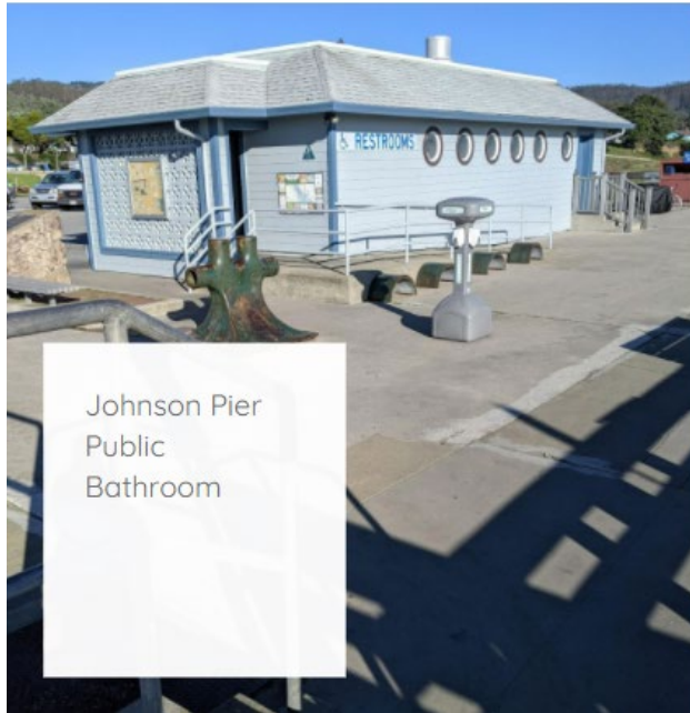
Johnson Pier Public Bathroom