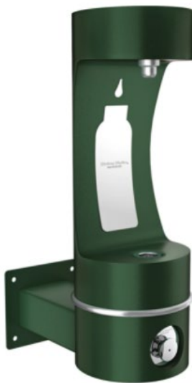
HALSEY TAYLOR 4405BF

Water bottle fill stations have many benefits, e.g., dramatically reduces the use of single plastic bottles which contribute significantly to pollution of land and sea, encourages hydration and promoting re-usable containers reduces waste.