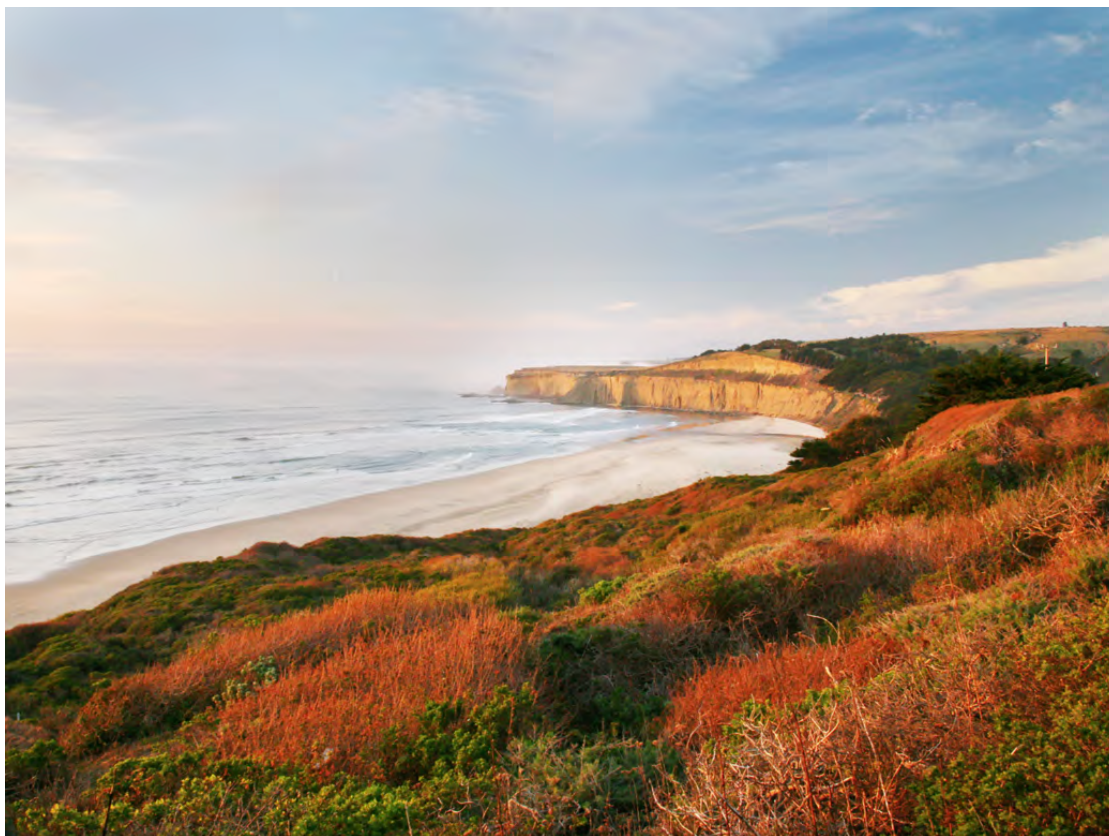
Heritage Trail route north from Tunitas Creek Beach

Page _____ of 13 *Resource Name or #: (Assigned by recorder) Ohlone/Portolá Heritage Trail P1. Other Identifier: _____